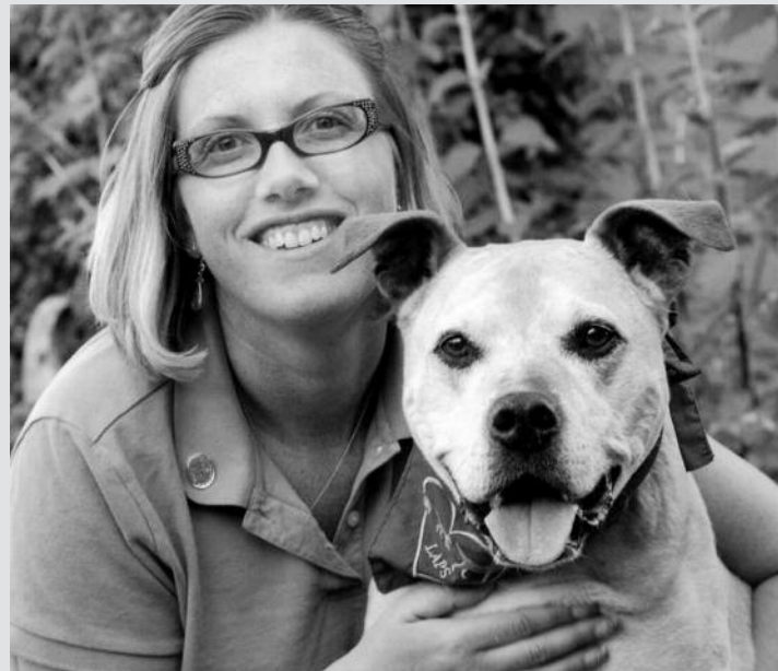
Remembering Albert Einstein, a very special dog who touched many hearts, many souls.