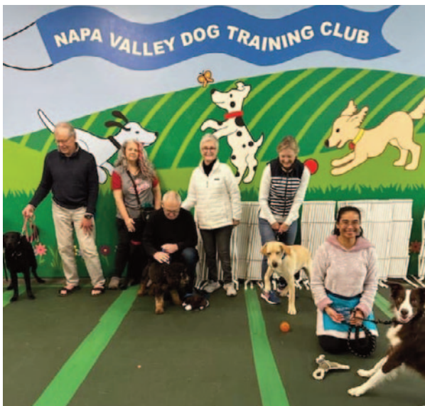
Wednesday 12 PM Adolescent