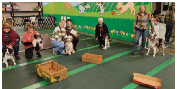
Wednesday 6 PM Adolescent