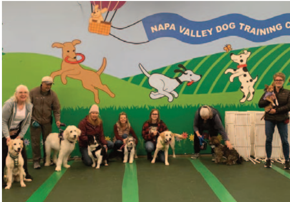
Wednesday 9 AM Puppy