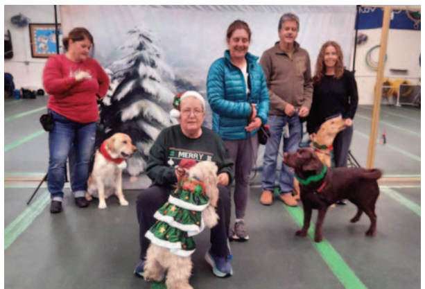
Strengthening the Basics