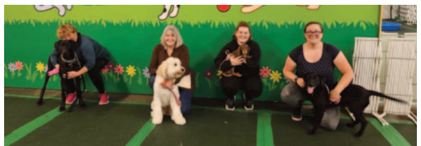
Wednesday 5 PM Puppy