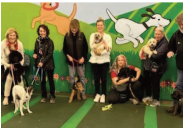
Wednesday 11 AM Puppy