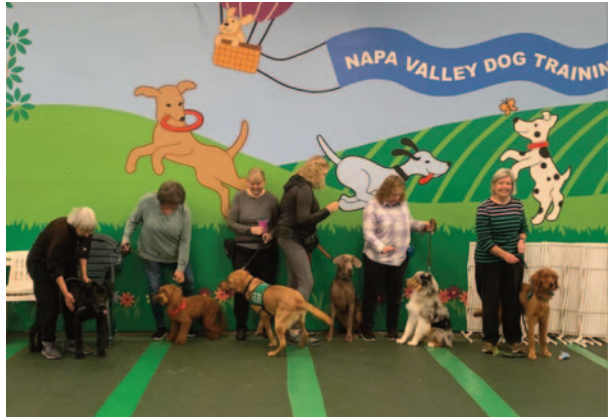
Wednesday 10 AM Adolescent