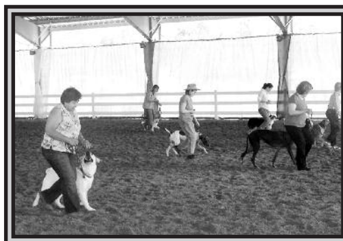
Practicing in the arena