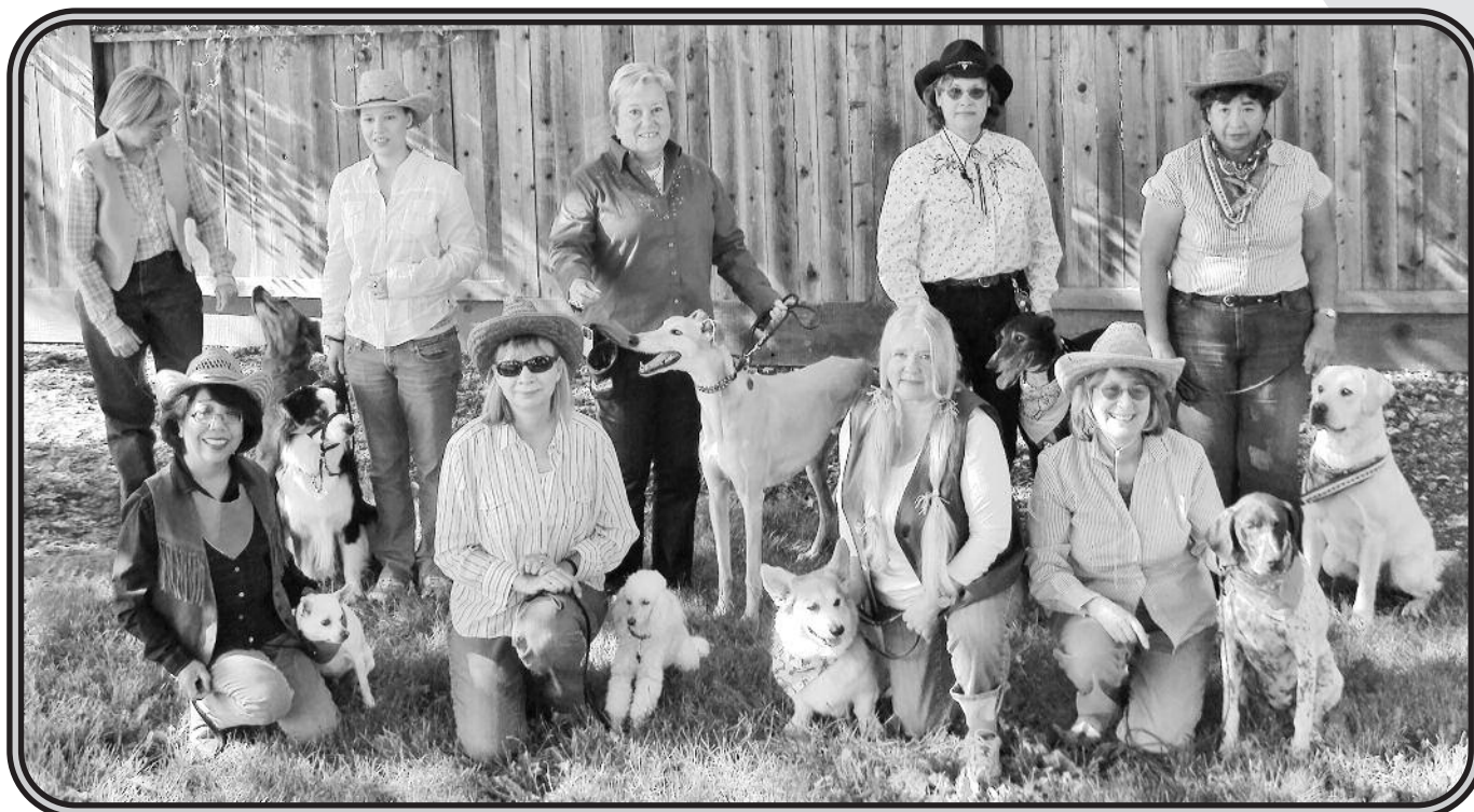
A group photo after dress rehearsal at Napa's Sunrise Park. Not pictured: Trish Iriye