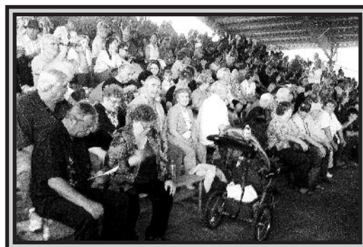
Up to a thousand attendees!