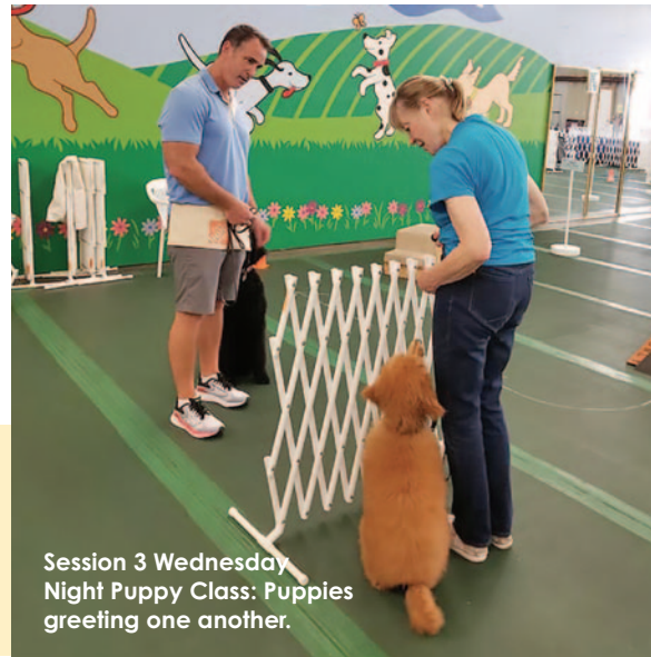
Session 3 Wednesday Night Puppy Class: Puppies greeting one another.

Do you have a special or cute dog picture you'd like to share?