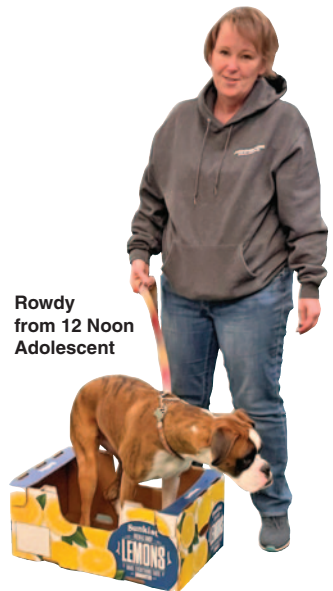
Rowdy from 12 Noon Adolescent