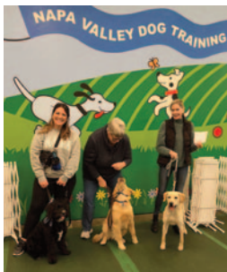
9 AM Puppy