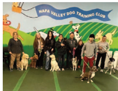
6 PM Adolescent