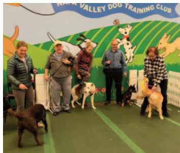
10 AM Adolescent