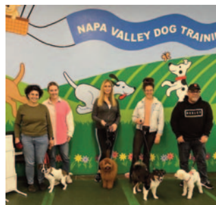
5 PM Puppy

CONGRATULATIONS to ALL of our Session 1 graduates! Pictured are graduates from the Wednesday puppy & adolescent classes.