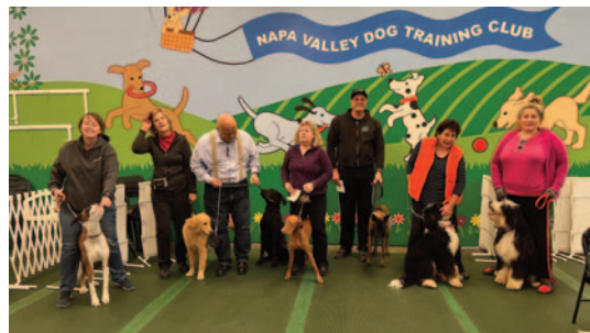
12 Noon Adolescent

CONGRATULATIONS to ALL of our Session 1 graduates! Pictured are graduates from the Wednesday puppy & adolescent classes.