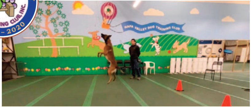
Suspended hide? Two minutes? 6 feet off the ground? No problem. Tim Medina and Rocket have this.

Each of the searches had requirements for each level. For example, in the Suspended Hide challenge for Level 1, the hide was 2 feet above the ground; for Level 2, it was 4 feet above the ground; and at Level 3, it was 6 feet above the ground.