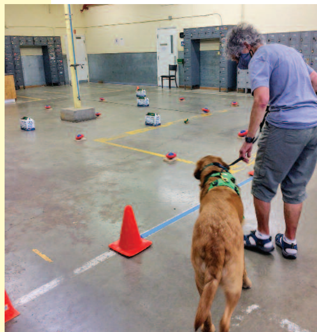
On the start line—ready to search