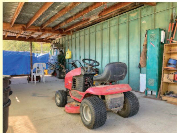
A very unique search area