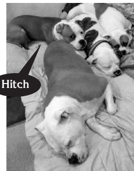
Hitch at home with his buds

There was not a single person watching who wasn't blown away with the incredible speed both Hitch and Nibbles used toward the decoy and the intensity with which they maintained their hold, even with distractions. Impressive too was how instantly the dogs responded when called off.