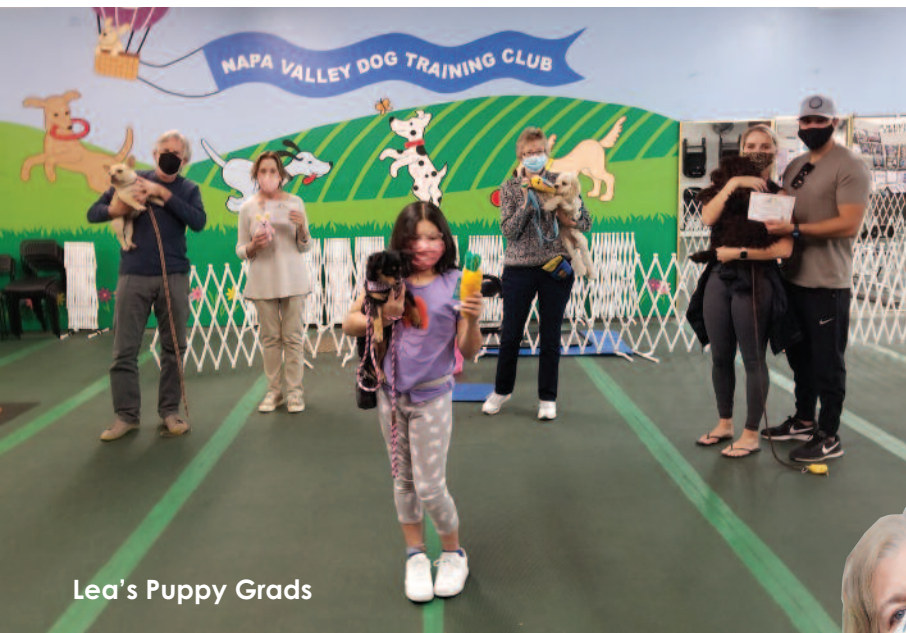
Lea's Puppy Grads

Napa Valley Dog Training Club • (707) 253-8666 • Clubhouse: 68 Coombs St., Bldg N Mailing Address: P.O. Box 4097, Napa CA • www.napadogtraining.org