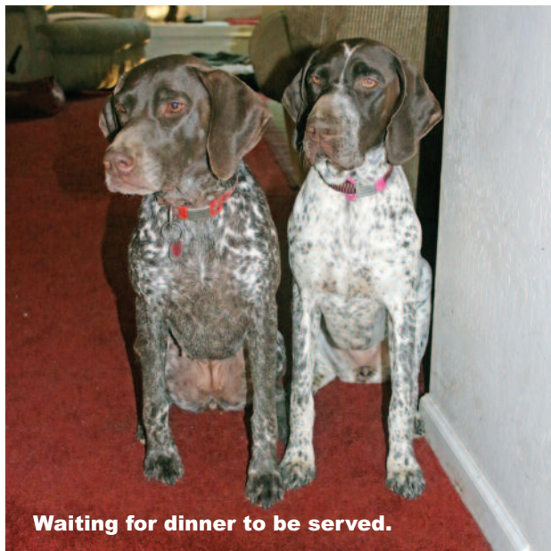
Waiting for dinner to be served.

I find it helpful to have both a wait and a stay because they are very different behaviors and I have a good use for both.