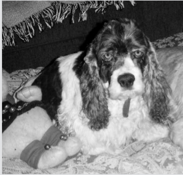
Rest in Peace Chloe