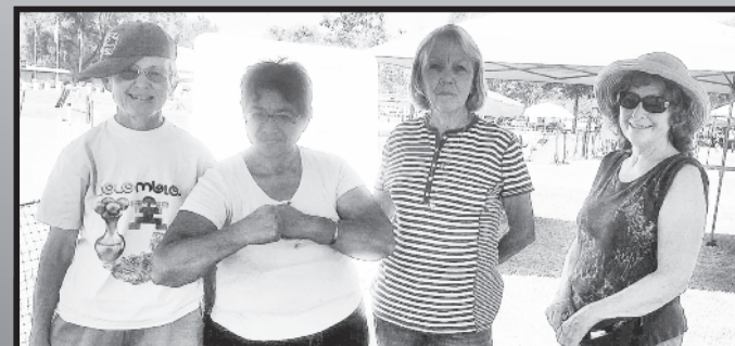
Just some of our agility trial volunteers who slowed down for a few seconds to pose for a photo.