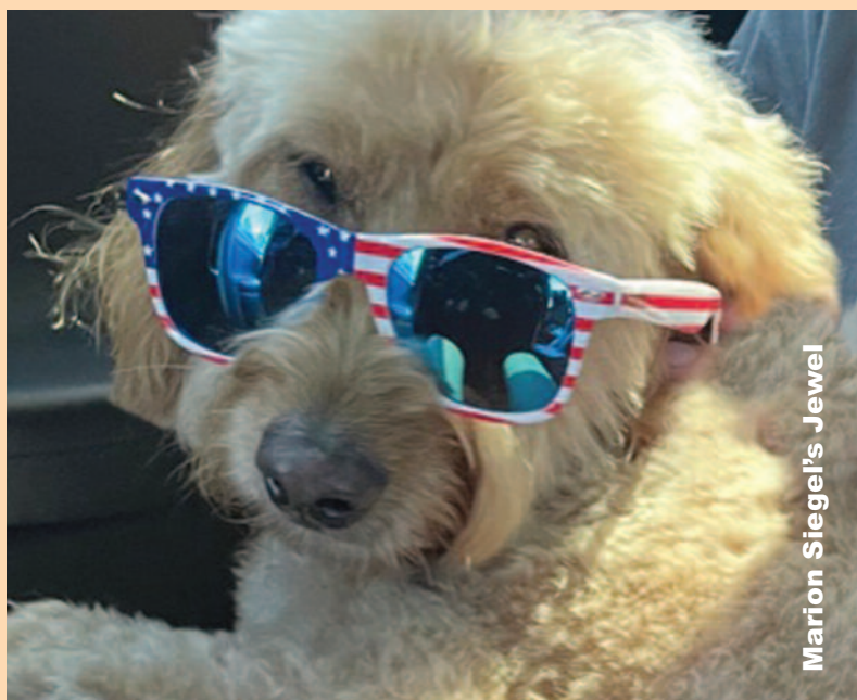
Marion Siegel's Jewel

Next Meeting: Barbecue Night All food provided by NVDTC! September 13, 2021 6:30 PM at the Clubhouse All COVID-19 Guidelines to be followed.